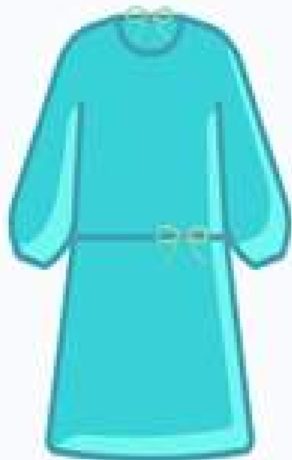
Medical Procedure Gown