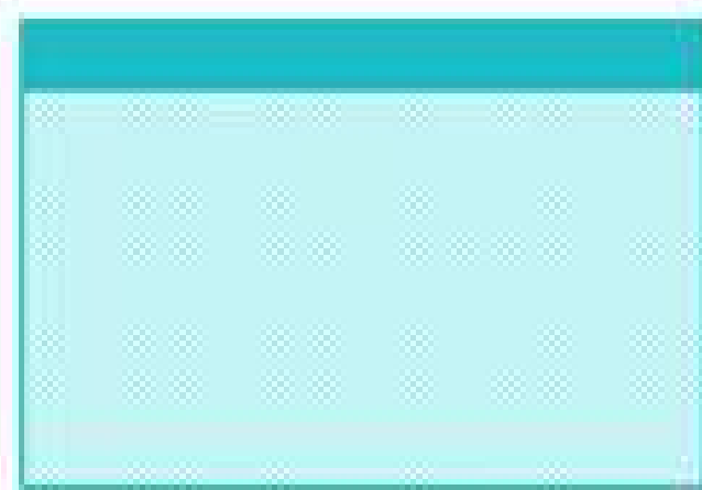
Small ABS Adhesive Drape