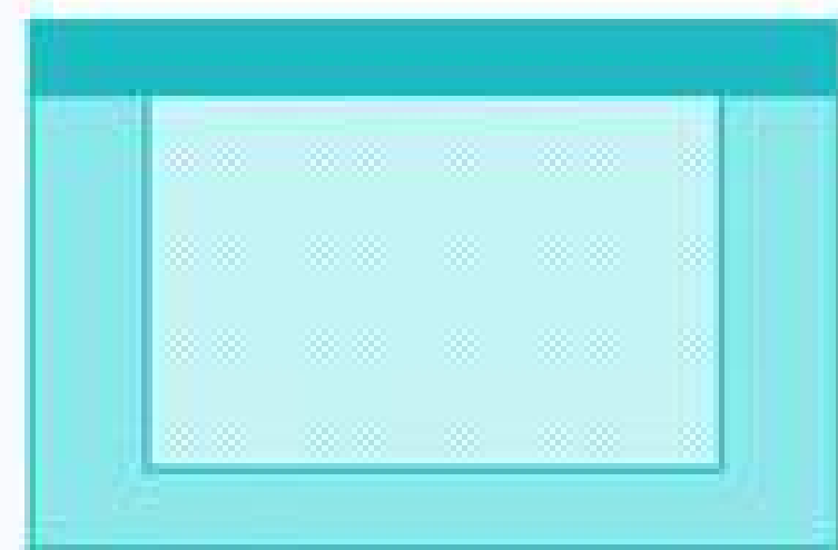
Large ABS Adhesive Drape