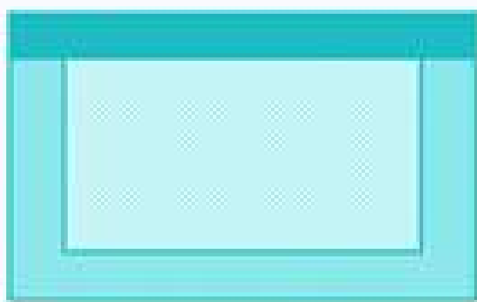
Medium ABS Adhesive Drape