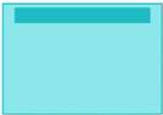
Medium Adhesive Drape