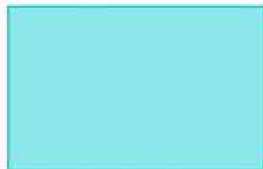
Main Trolley Drape